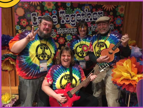
Umpqua Community College Financial Aid Team