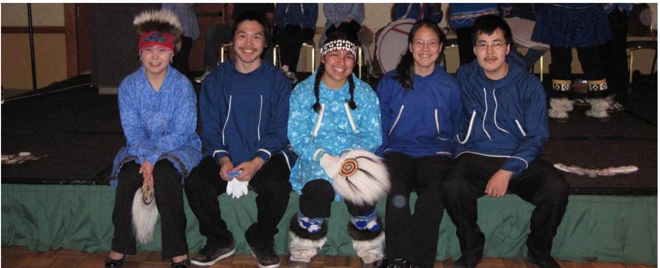
Students from the University of Alaska Fairbanks shared stories, dances, games and laughter at the WASFAA Annual Conference in April, 2009.