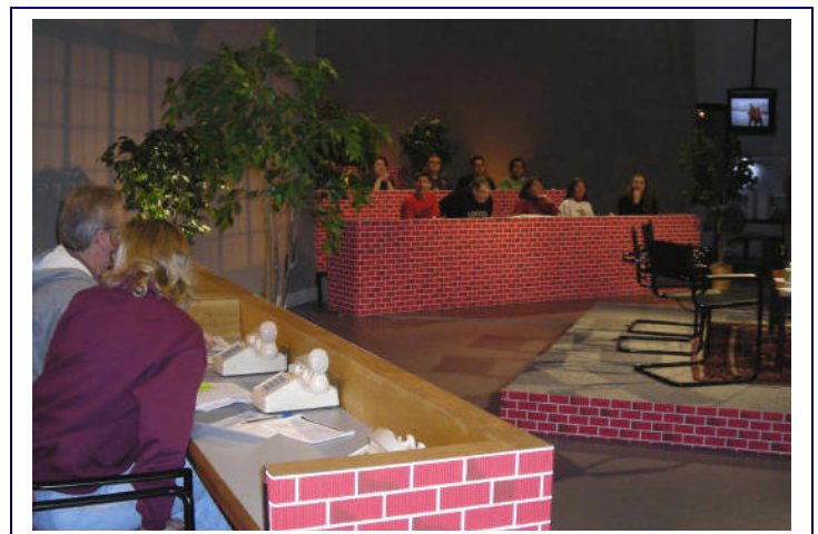
OASFAA volunteers on the set before the broadcast begins.